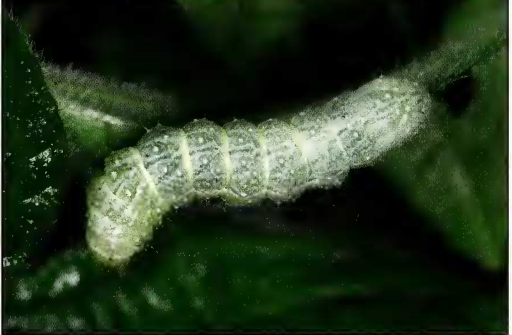
Fig. 13. Larva of Abrostola canariensis in penulti- Fig. 14. Larva of Abrostola canariensis in penulti-December 2011).

served within the subfamily Catocalinae, e.g., the non-parallel sided darker dorsal field, the overall shape, and their behaviour. The higher classification of Noctuoidea has been in great flux recently and the closer affinity of some subfamilies formerly assigned